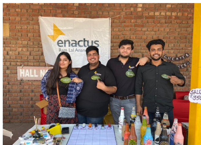
Shelf-E-Book Book Festival